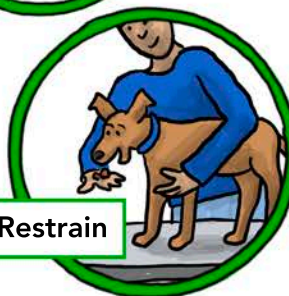
Hug / Restrain