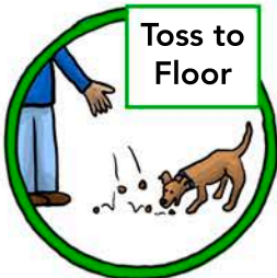
Toss to Floor