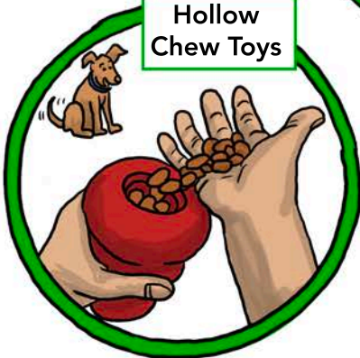
Hollow Chew Toys