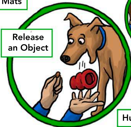
Release an Object