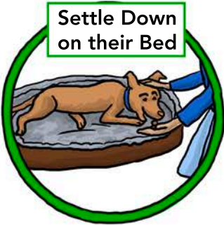
Settle Down on their Bed